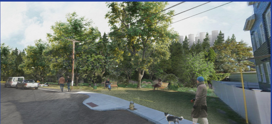
Enhanced landscaping and buffers along Derby Street. (View looking east along Derby Street)