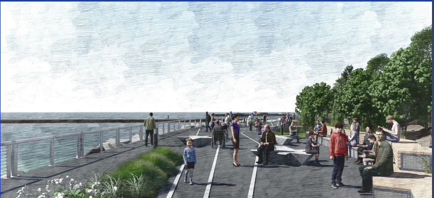
Conceptual rendering: Proposed limited access waiting and load area for future cruise ships. (Note: Cruise ship berthing facilities are not included in this offshore wind terminal project.)