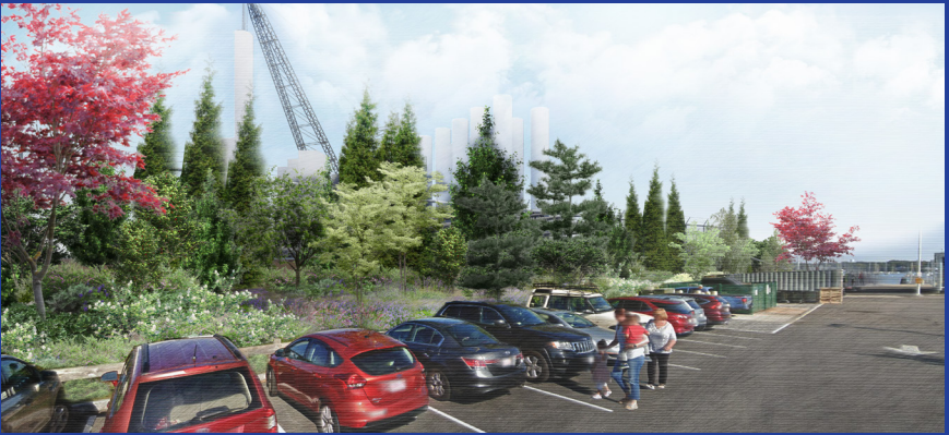
Proposed enhanced landscaping along ferry terminal parking lot. (View looking south east along edge of parking lot)