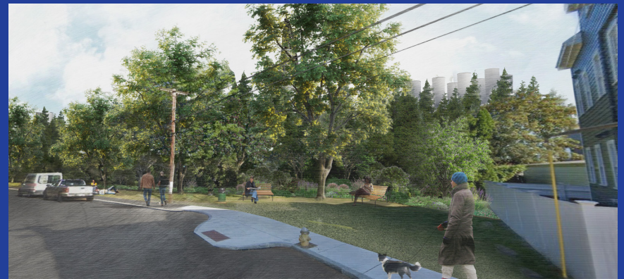
Enhanced landscaping and buffers along Derby Street. (View looking east along Derby Street)