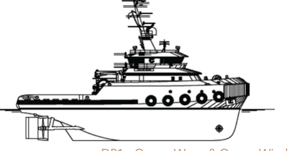
DP1 - Ocean Wave & Ocean Wind