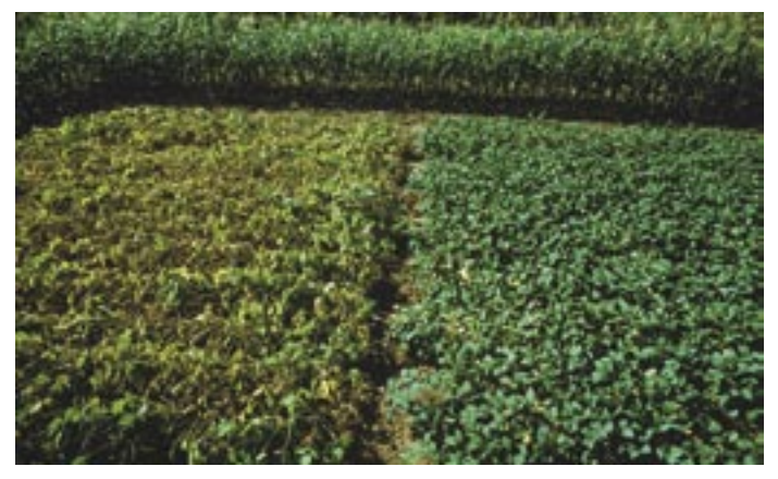
Symptoms in non-tolerant (left) and tolerant (right) soybean infected with soybean rust.

Seedborne transmission of the disease has not been documented, but there is some concern that seed lots may contain small amounts of infected plant debris capable of spreading the pathogen. To date, seed lots have not proven to be a pathway for the disease. Clouds of spores are released if infected plants are disturbed by wind or by individuals walking through rust-infected areas. Individuals who are sampling for soybean rust may transport spores from one area to another on clothing. If clothing is exposed to spores, care should be taken to prevent the spread of soybean rust to uninfected locations.