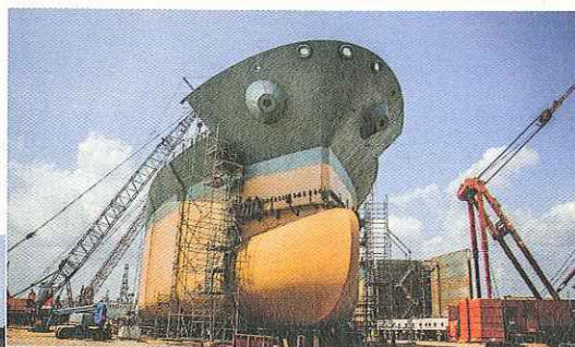
Above and left, the 330,000-bbl barge 750-1 at VT Halter Marine, in Pascagoula, Miss. The ship-like barge has a flared bow rising from a bulbous nose.