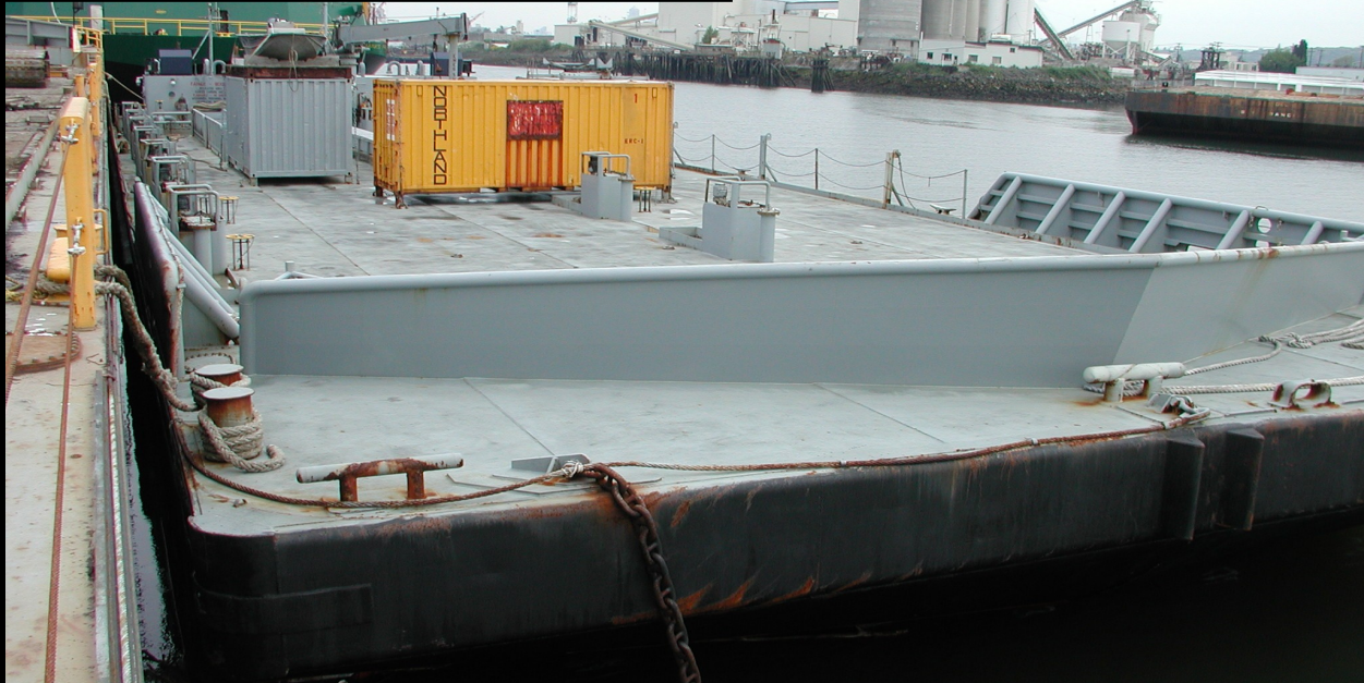
180-2 DECK PLAN